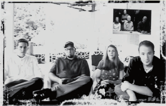
Four members of Wycliffe USA's IMC team during a live satellite interview from the Democratic Republic of Congo