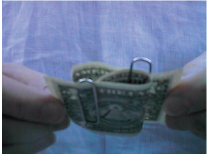
Paper Clip Link-Up