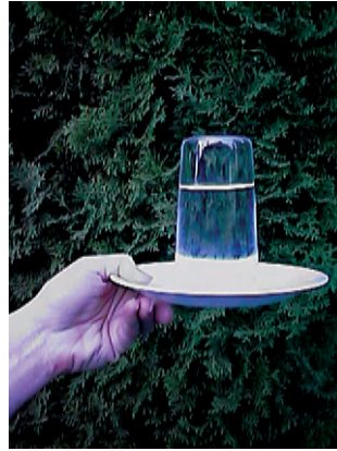
Don't Get Wet!